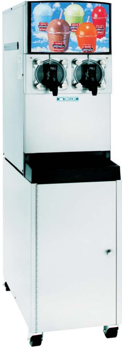
Shown with optional syrup storage cart